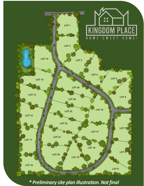
* Preliminary site plan illustration. Not final